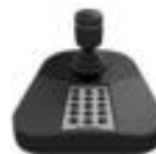
DS-1005KI USB Joy-stick

*DS-1673ZJ should be used with DS-1661ZJ or DS-1602ZJ.