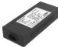
LAS60-57CN-RJ45 Hi-PoE midspan