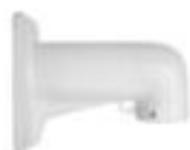
DS-1618ZJ Wall Mount