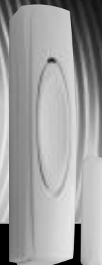
Impaq SC-W Wireless Shock and Contact