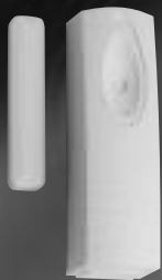
Impaq SC Wired Shock and Contact