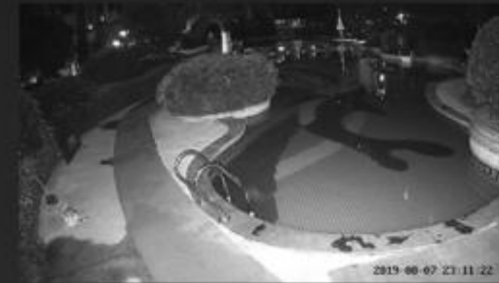
Night Vision with Built-in LEDs