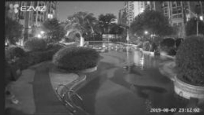
C3X Night Vision*

Leveraging supplemental lights to achieve color night vision was brilliant – until the introduction of the C3X. The C3X uses dual lenses and dual infrared lights to render better color images even in the lowest light conditions. There's no need for spotlights. C3X's colors are more natural, and the image is more evenly-illuminated.