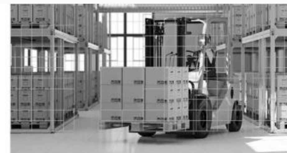
H.265 (Upgraded Video Compression)