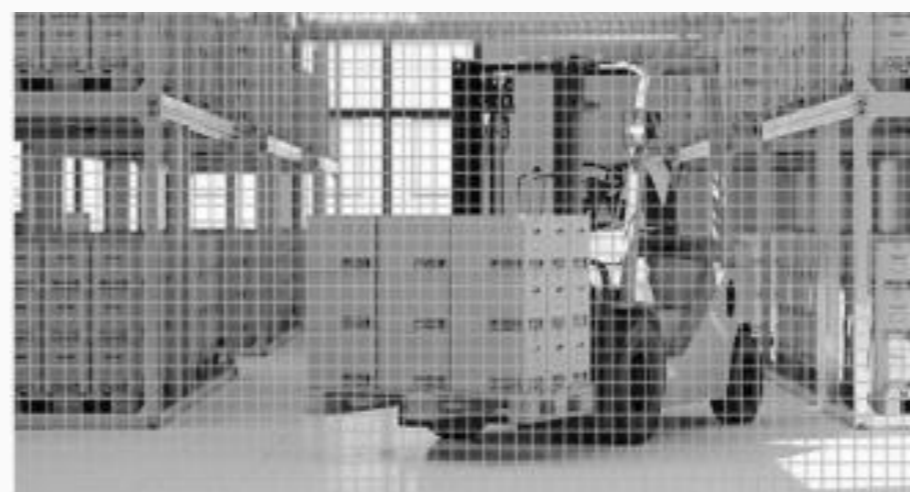
H.264 (Mainstream Video Compression)

Using the latest H.265 video compression technology, the C3X renders clearer and smoother video while reducing the need for data storage space and bandwidth.