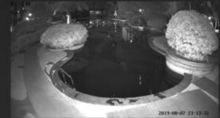
Traditional Black/White Vision

*In extreme environments, such as a completely enclosed warehouse or rural areas in a moonless cloudy night, the C3X will shift to black/white mode to ensure utmost image clarity.