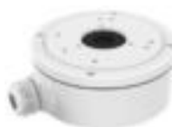
CBS Junction Box